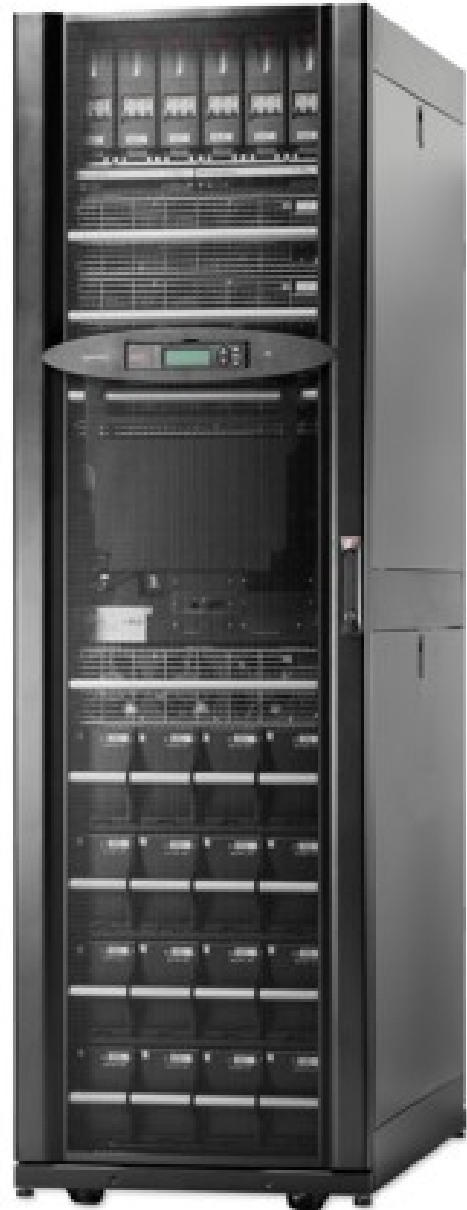
Symmetra PX 48kW

In one rack, the Symmetra PX 48kW delivers the high availability, extreme agility, and low TCO you have come to expect from the Symmetra PX family.